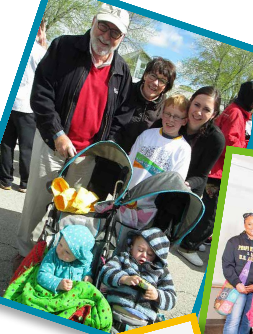
So many wonderful donors and friends came out to the Walk for Children! HaHa Clinton-Dix made the rounds walking and visiting with our presenting sponsor the Harley-Davidson Motor Company along with Bostik, the Shapiro and Gettleman families and so many more.