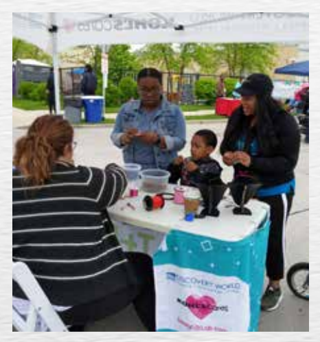
Children and their families enjoyed interactive activities from Discovery World's Kohl's Design It! Lab.