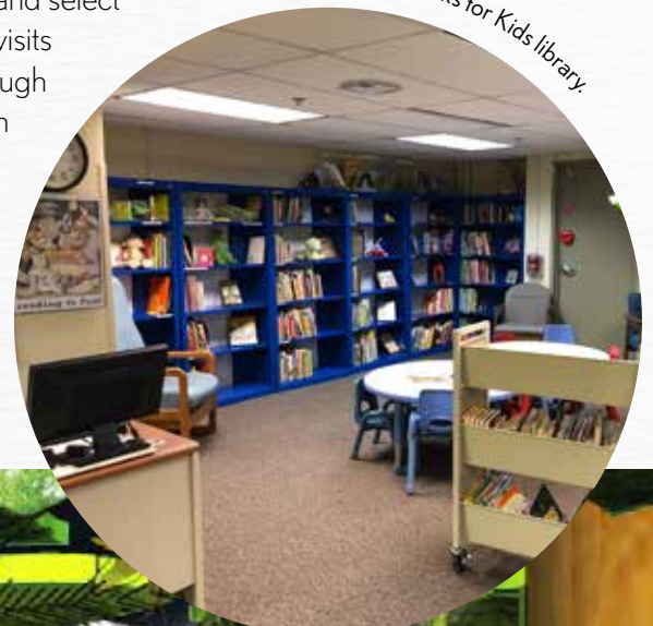
Current Books for Kids library.

Rendering of the new Books for Kids library.