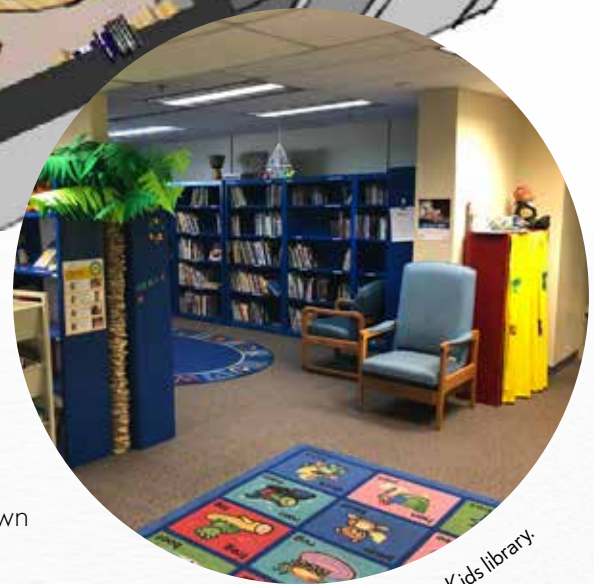
Current Books for Kids library.