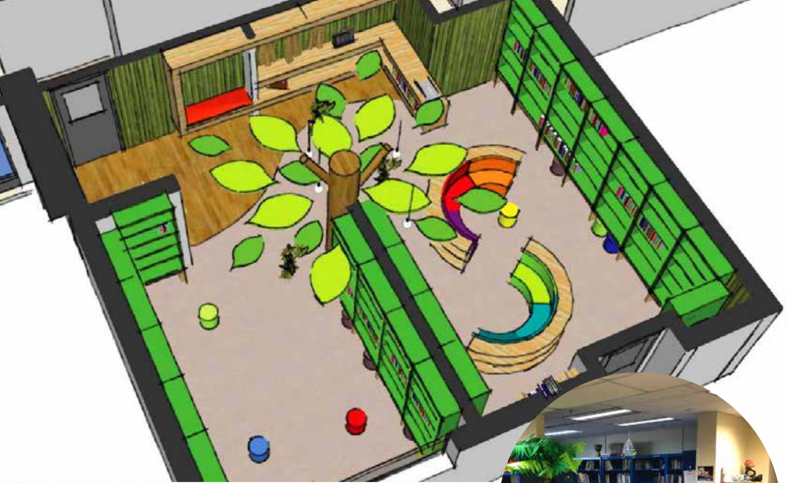
Rendering of overhead view of the new Books for Kids library.

Each school day, classrooms visit the Library for “Read with Me” sessions where community volunteers read one-on-one with children. Afterward, children choose a book, give it a hug, and take it home to build their very own libraries. The redesigned Books for Kids Library emphasizes the idea of “Read with Me” as an in-house field trip to a unique space that sparks the imagination and gets young children excited about reading.