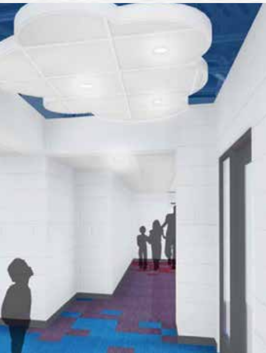
Renderings of a new hallways.