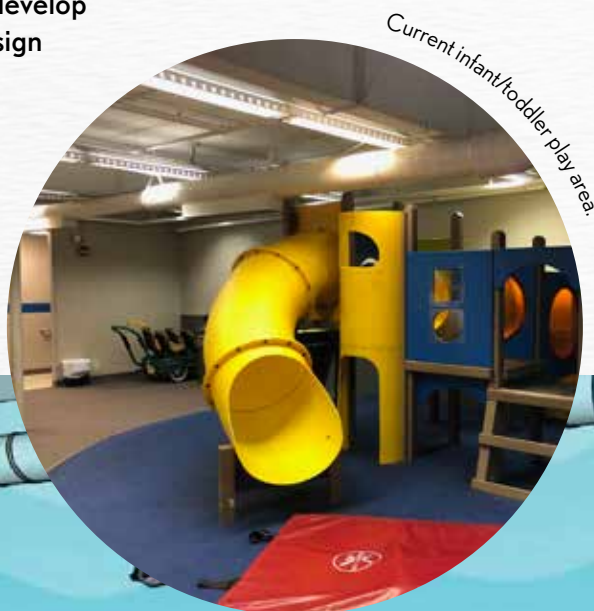
Current infant/toddler play area.

Rendering of "Under the Sea" themed infant/toddler play area.