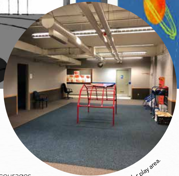
Current preschooler play area.