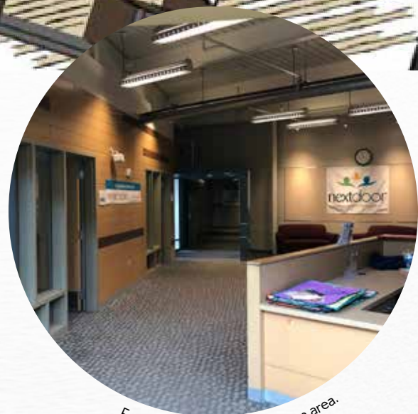
Former entrance and reception area.

The new Community Café will provide parents a space to interact with one another, learn about programming and updates at Next Door, access community resources and to connect with their family support team.