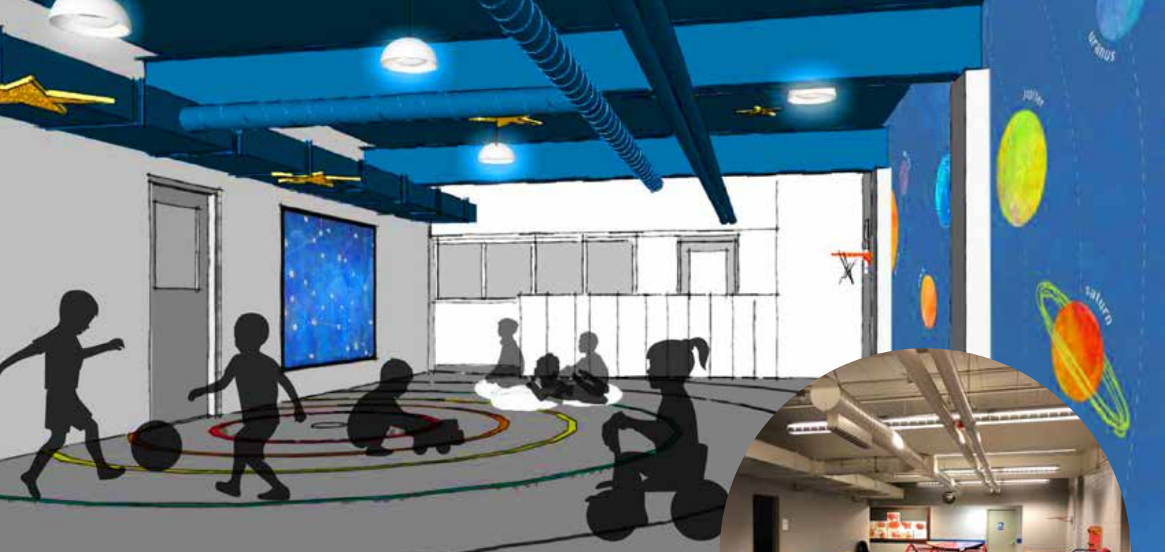
Rendering of "Outer Space" themed preschooler play area.