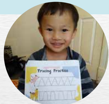
Jackson shows off a tracing worksheet he completed as part of a lesson on developing fine motor skills.