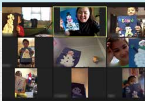
One of our Parent Educators leads a virtual family socialization event making snowmen together.