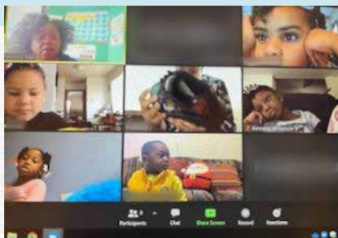
A student shares his new pair of shoes with his classmates during a "Sharing Day" in this K4 classroom over Zoom.