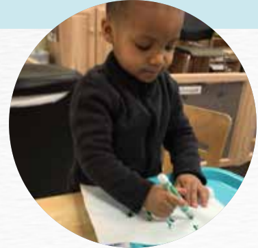
Nixon works on his early writing skills with different paper textures.