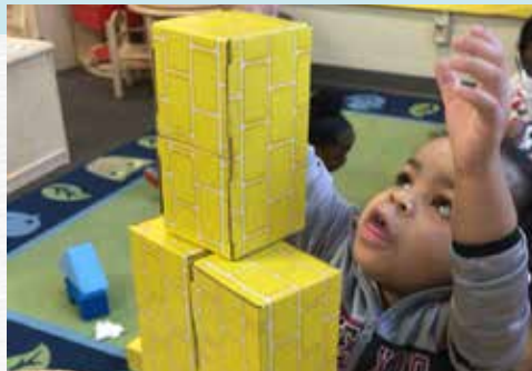
Precious likes to explore the cardboard blocks in her classroom and build the tallest towers!